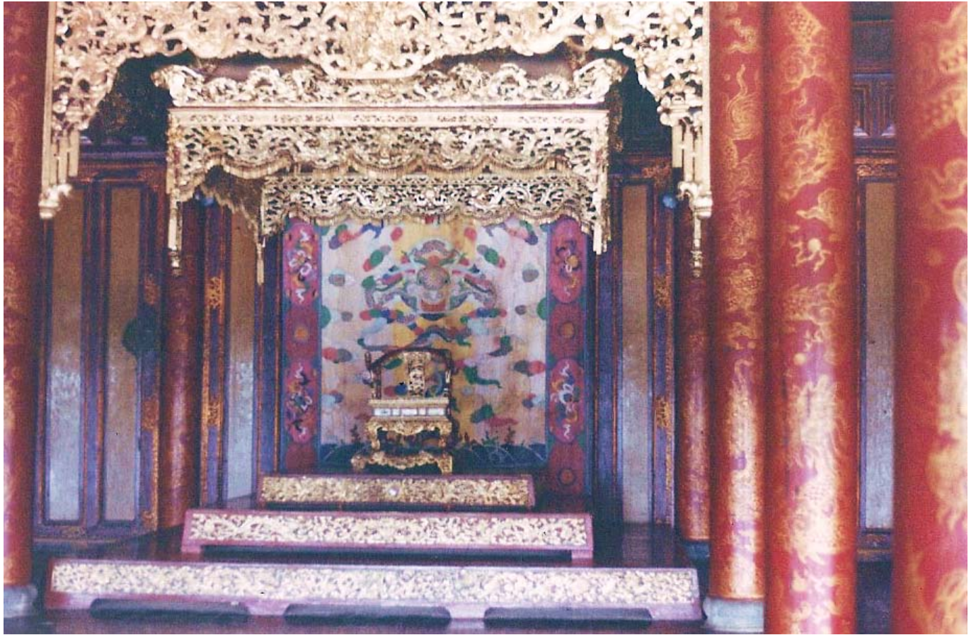
The Throne Room at The Citadel.