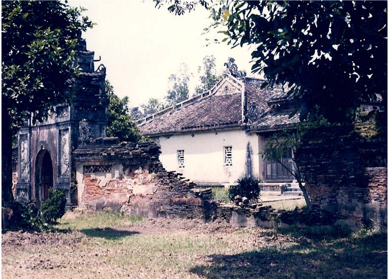
Damaged wall from the fierce fighting between the Marines and the North Vietnamese inside The Citadel still not repaired after the Tet Offensive in 1968.